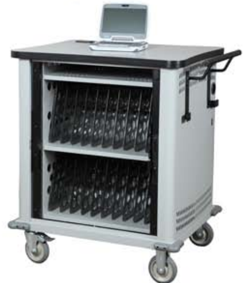
CSC-CM20, CSC-CM26, CSC-CM32