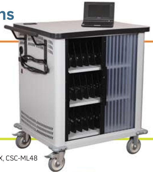
CSC-ML30, CSC-ML27X, CSC-ML48

The NetBook Carrier (NBC) provides a safe and easy way to transport 20, 26, 27, 30, 32 or 48 netbooks in a school, government, training, or corporate environment. The NBC provides storage and charges 30 mini netbooks. The dual entry capability of the NBC helps to ensure the security of stored equipment and timer configurations. The tambour door opening allows teachers and students to access the netbooks and other equipment while limiting access to the electrical components and timer, which can be accessed through the locking rear door panel by IT staff.