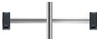
Auxiliary Speaker Bar

FPPSP31 - 31" Speaker Bar, Aluminum - 0 96633 26890 0