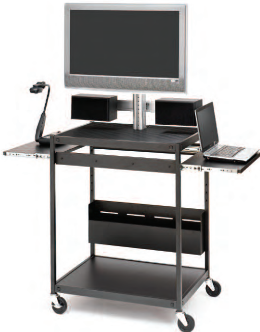
TC12FC-BK with optional FPPSP31 Speaker Bar

FPPSP31 - 31" Speaker Bar, Aluminum - 0 96633 26890 0 CFPS - 4 Outlet Electrical Unit (inc. on FF models) - 0 96633 10076 7 UCSE10 - 10 Outlet Electrical Unit - 0 96633 11038 4