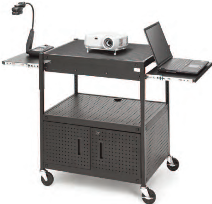
Shelves pull out left and right for computers and projectors

FPPSP31 - 31" Speaker Bar, Aluminum - 0 96633 26890 0 CFPS - 4 Outlet Electrical Unit (inc. on FF models) - 0 96633 10076 7 UCSE10 - 10 Outlet Electrical Unit - 0 96633 11038 4