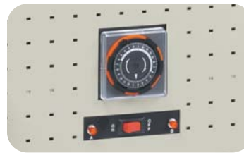
OPTIONAL: LAP18EBA-GM AUTOMATIC TIMER ALLOWS BOTH CHARGING UNITS TO BE PLUGGED INTO THE TIMER

Electrical units are UL listed, overload protected, includes a 20' power cord, and has an on/off switch located at the base. When using both electrical units at the same time, each unit must be plugged into outlets on separate electrical circuits. This is to prevent the overload and tripping of the circuit breaker. The electrical units are rated for a maximum of 15 amps usage each, however, to prevent nuisance tripping of the breaker you should not exceed 13 amps of usage each for an extended period of time.