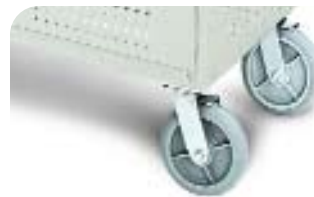
NOTEBOOK CARTS CAN BE ORDERED WITH 8" RUBBER CASTERS PERFECT FOR MOVING LAPTOPS ACROSS CAMPUS