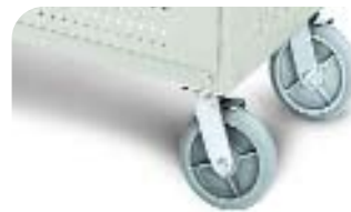
NOTEBOOK CARTS CAN BE ORDERED WITH 8" RUBBER CASTERS PERFECT FOR MOVING LAPTOPS ACROSS CAMPUS