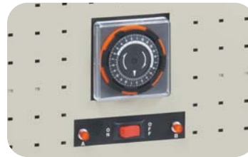
OPTIONAL: LAP2MR AUTOMATIC TIMER ALLOWS BOTH CHARGING UNITS TO BE PLUGGED INTO THE TIMER

Electrical units are UL and C-UL listed, overload protected, includes a 20' power cord, and has an on/off switch located at the base. When using both electrical units at the same time, each unit must be plugged into outlets on separate electrical circuits. This is to prevent the overload and tripping of the circuit breaker. The electrical units are rated for a maximum of 15 amps usage each, however, to prevent nuisance tripping of the breaker you should not exceed 13 amps of usage each for an extended period of time.