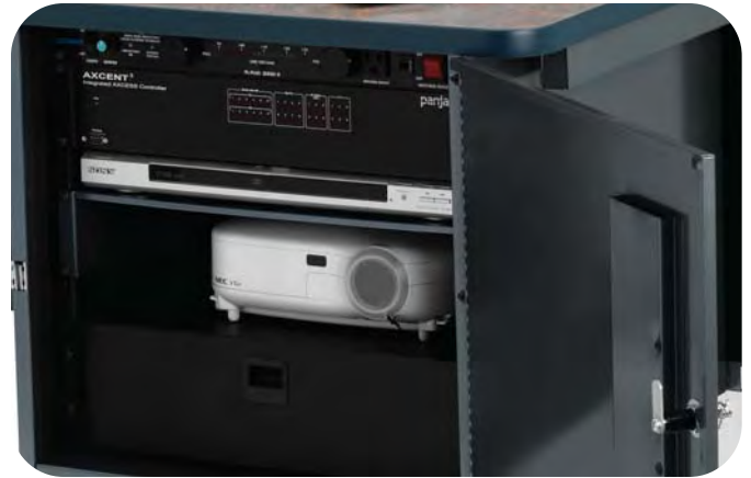
Locking cabinet includes 19" rack mount rail system and two equipment shelves.

Carton Pack: 33-1/4"w x 54"l x 8"h UCS880-GM - 0 96633 29811 2 PUCS880_- Custom Product, No UPC Code Available