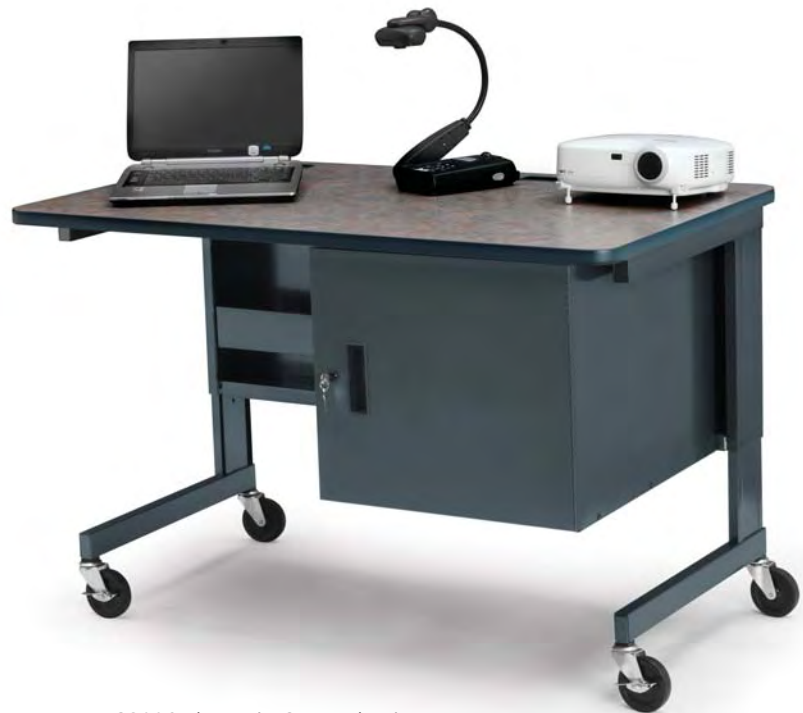
UCS880 shown in Crayon laminate with Topaz paint and trim

UCS880 - AN - 102 - A Model No. Paint Laminate Trim