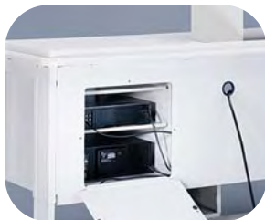
Rear access panel for easy access to equipment for cable management.

The UCS880 overall dimensions are 51"w x 30"d x 26-33"h with the work surface height adjustable in 1" increments. Lower cabinet is constructed from 18-gauge steel and includes a key locking door, two keys included. The cabinet interior has 19" rack mount rails and includes two rack mount accessory shelves. Shelves are constructed from 18 gauge steel. A rear access panel is located behind the rack mount cabinet for access to power and data ports. The table top is 1" thick, 45 lb density particle board, with laminate surface and 3mm vinyl edge band. Four grommet holes are located at the rear of the work surface, measuring 1-1/2" x 4", and provide access to the integrated cord management channel and rear of the cabinet. Modesty panel is constructed from 18-gauge steel. All steel parts are constructed using "prime" steel which contains 25% to 35% post-consumer recycled material. Model ships ready to assemble in one carton via truck.