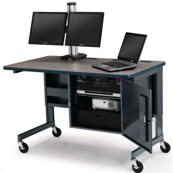
UCS880 shown with multiple desk display FPSM-D-DIS2-AL